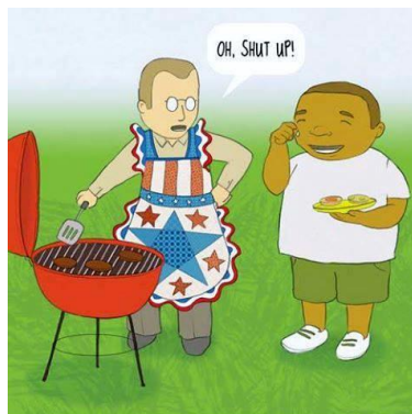
The quilted apron: just another sign that you live with a quilter.